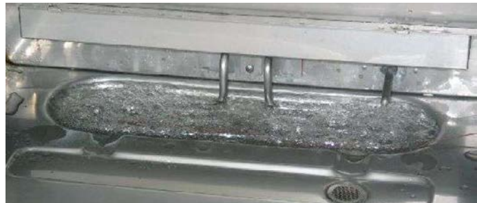
A humidity bath heats water right in the chamber for faster response, and is easier to maintain than traditional steam generators.