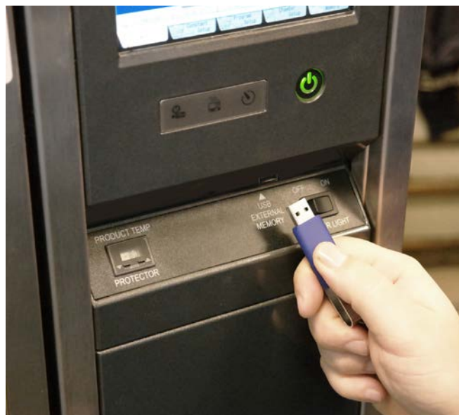
New: Upload and download programs via USB thumb drive.

Easy to understand screens allow access to chamber and test configuration settings. The P-300 now can save three different constant setups, as well as 40 test programs.