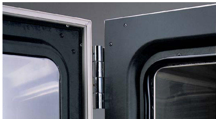
Rounded interior corners and black resin thermal breaks around the door and doorframe are unique features found only on ESPEC chambers.