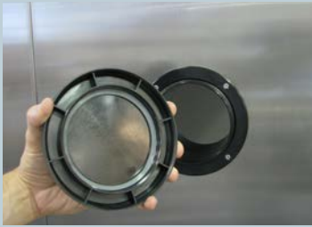
2", 4", or 6" diameters available