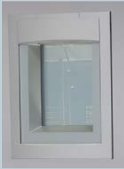
8 & 14 cu. ft.: 9" x 10.3" window 32 cu. ft.: 17" x 10" window