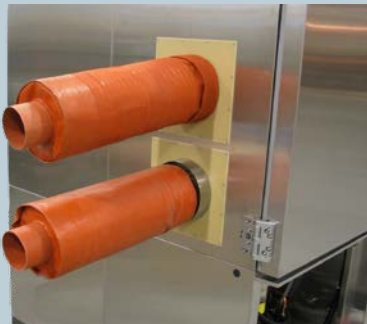
14 & 32 cu. ft. models can be modified to supply conditioned air to a remote chamber